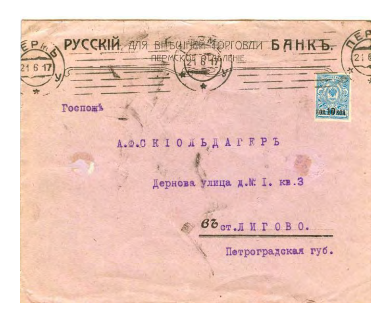
Fig. 1. Cover with 10-kopeck imperforate stamp.

The cover with the arms-type stamp, fig. 1, appears to be genuine. The 10-kopeck rate is correct; the town of Perm machine cancellation raises no questions. There is an indistinct receiving postmark on the back of the cover, but it also raises no questions. The stamp, though, is imperforate! Nice find! However, closer examination is in order.