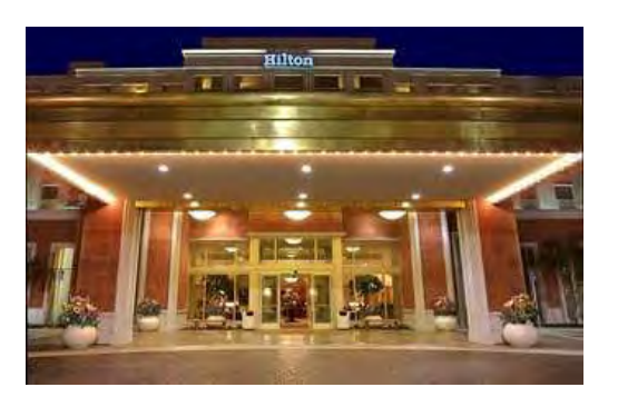
L: The Santa Clara Convention Center, site of the ASDA Summer Postage Stamp Show and ROSSICAPEX 2009; R: The Santa Clara Hilton, across the