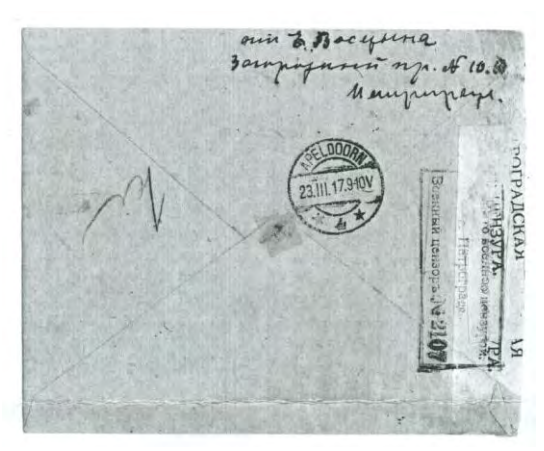
Unusual Cover 3 from Petrograd (front and back)