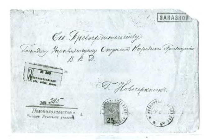
Unusual Cover 1