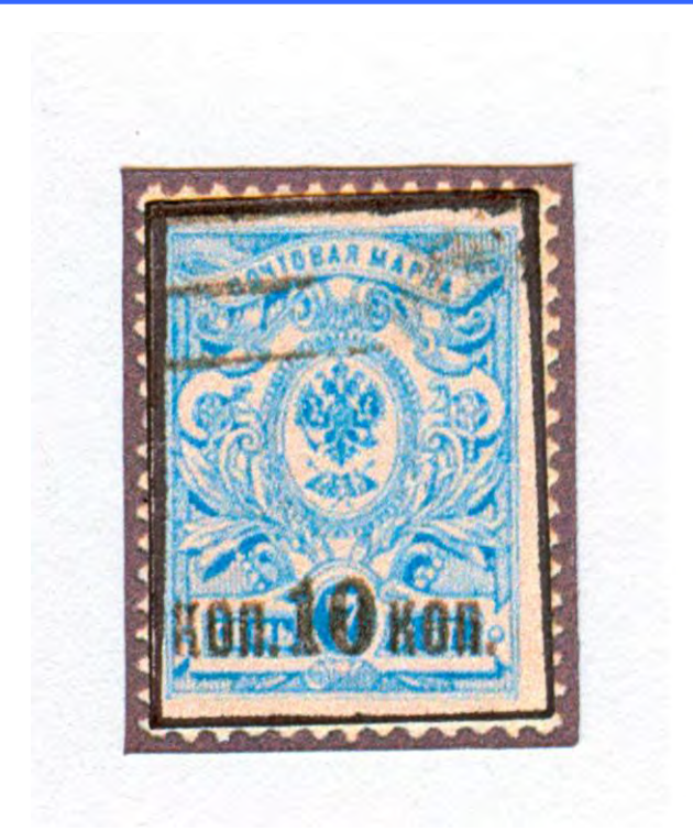
Fig. 2. Imperforate stamp placed over perforated stamp and enlarged 400 %. The black border around the imperforate stamp was added by hand in order to show the actual size of this stamp.

If the stamp is in fact imperforate, then a comparison with a perforated stamp is required. The test is simple: when a perforated stamp is placed over the imperforate stamp, the borders of the imperforate stamp coincide with the edges of the covering stamp. If the imperforate stamp is smaller in the X-Y dimensions, then it is a "manufactured" item, i.e. a forgery.